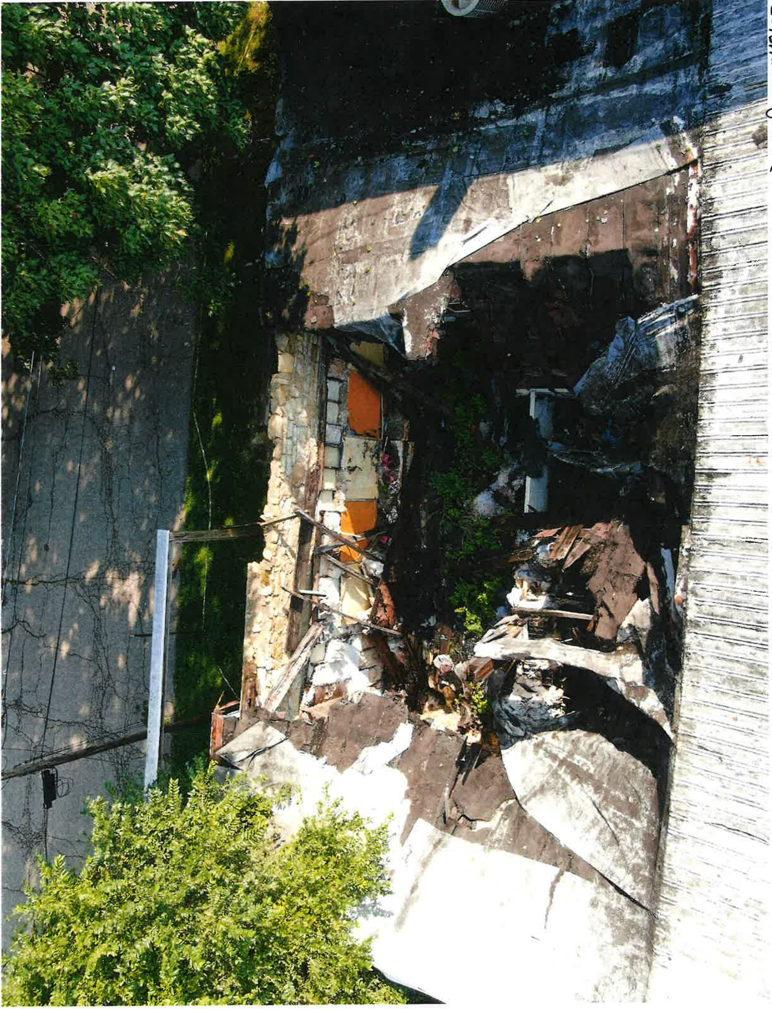
Drone Photo 8/18/23