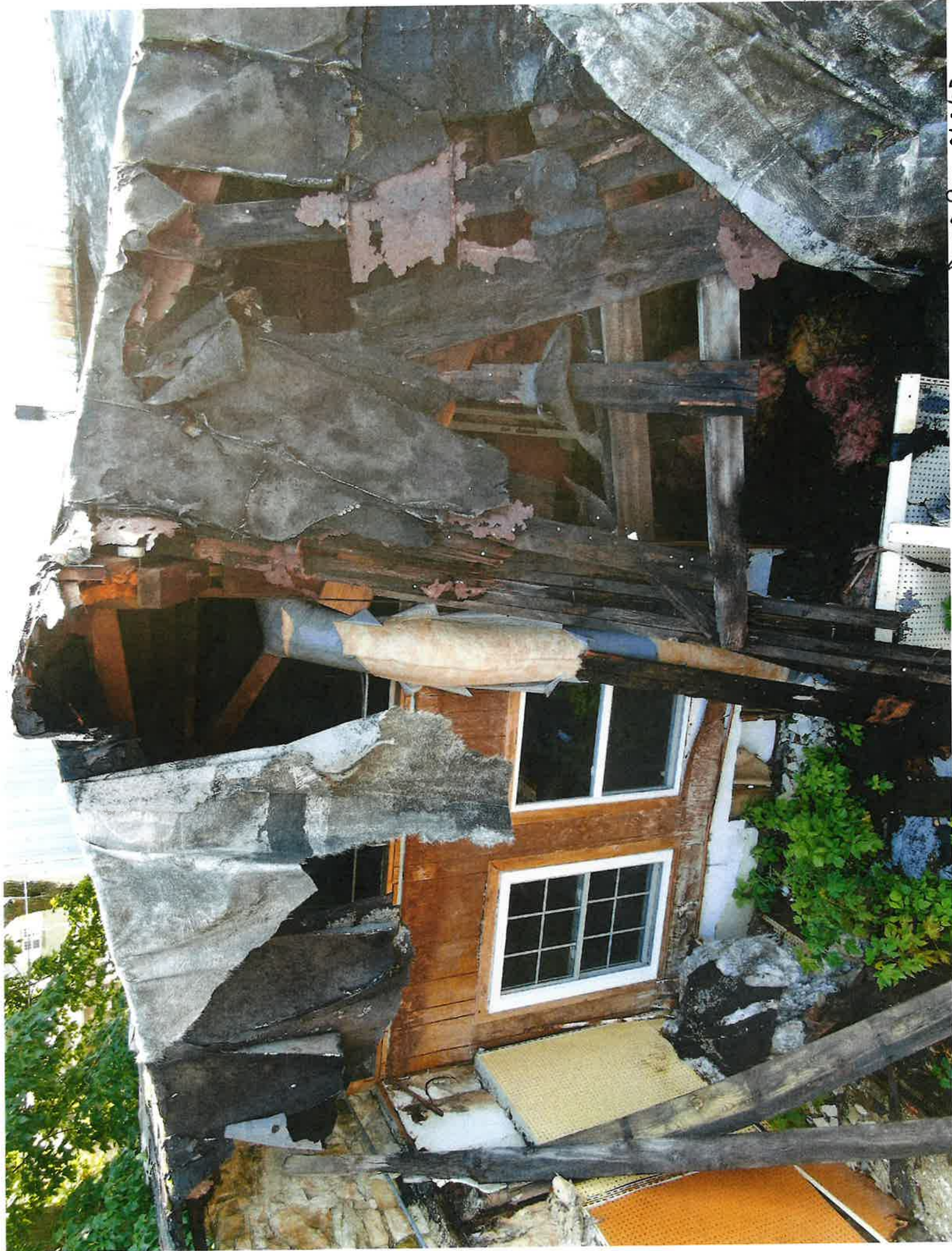
DiANE PHOTO 8/18/23